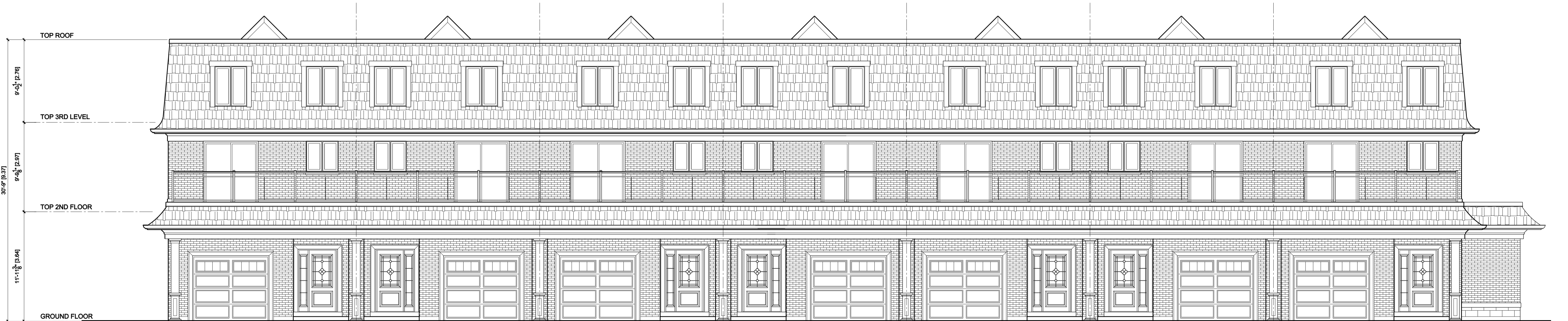
3 STOREY BLOCK REAR ELEVATION TYPICAL BLOCK 8