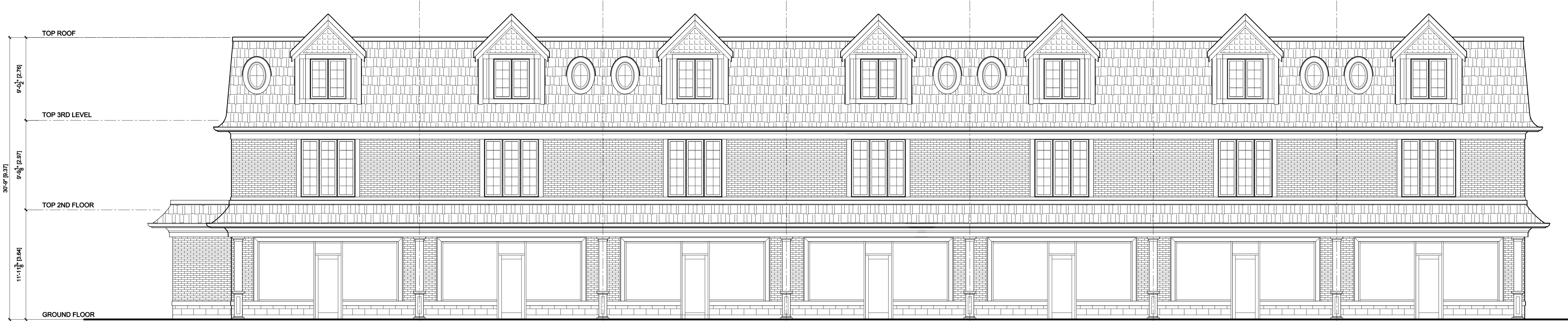
3 STOREY BLOCK FRONT ELEVATION TYPICAL BLOCK 8