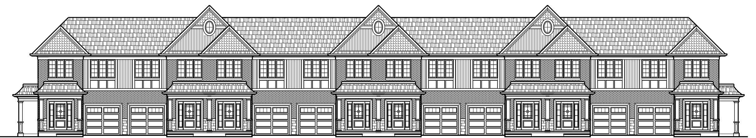
BLOCK 3: 8 - 2 STOREY TOWNS + 2 BASEMENT RENTAL UNITS