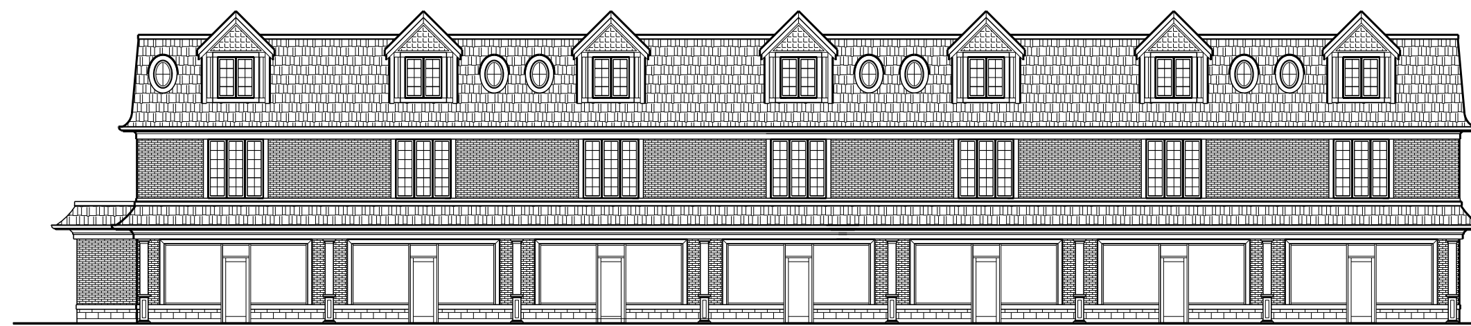
BLOCK 8: 7- 3 STOREY TOWNS