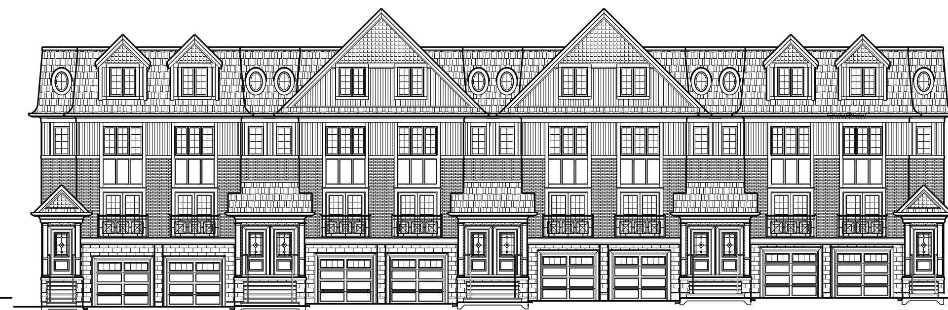
BLOCK 11: 8 - 3 STOREY TOWNS