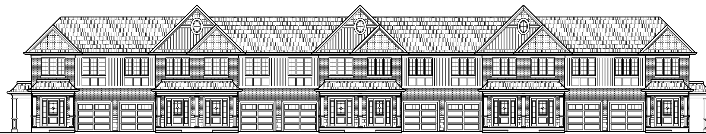
BLOCK 2: 8 - 2 STOREY TOWNS + 2 BASEMENT RENTAL UNITS