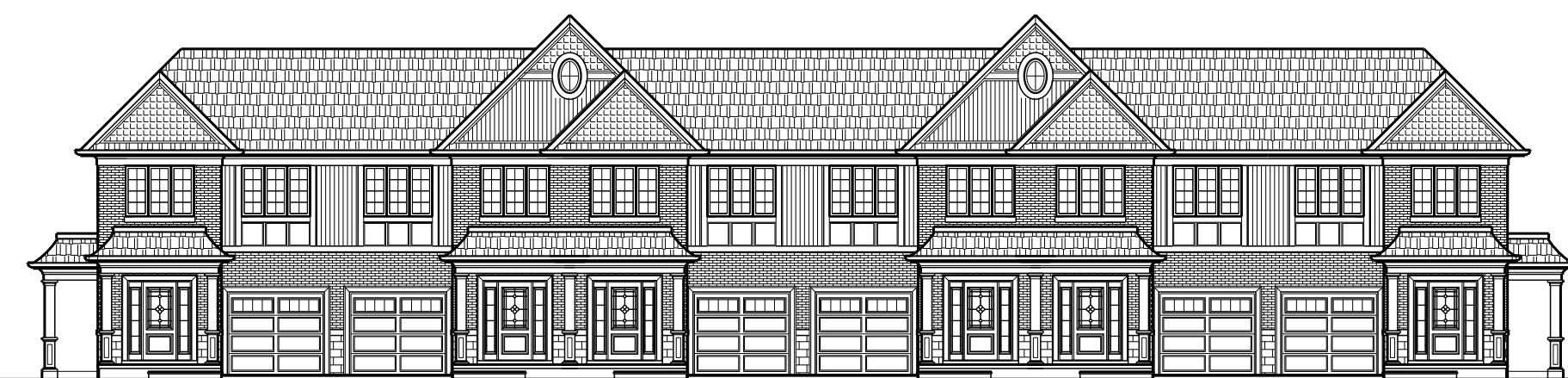
BLOCK 4: 6 - 2 STOREY TOWNS + 2 BASEMENT RENTAL UNITS