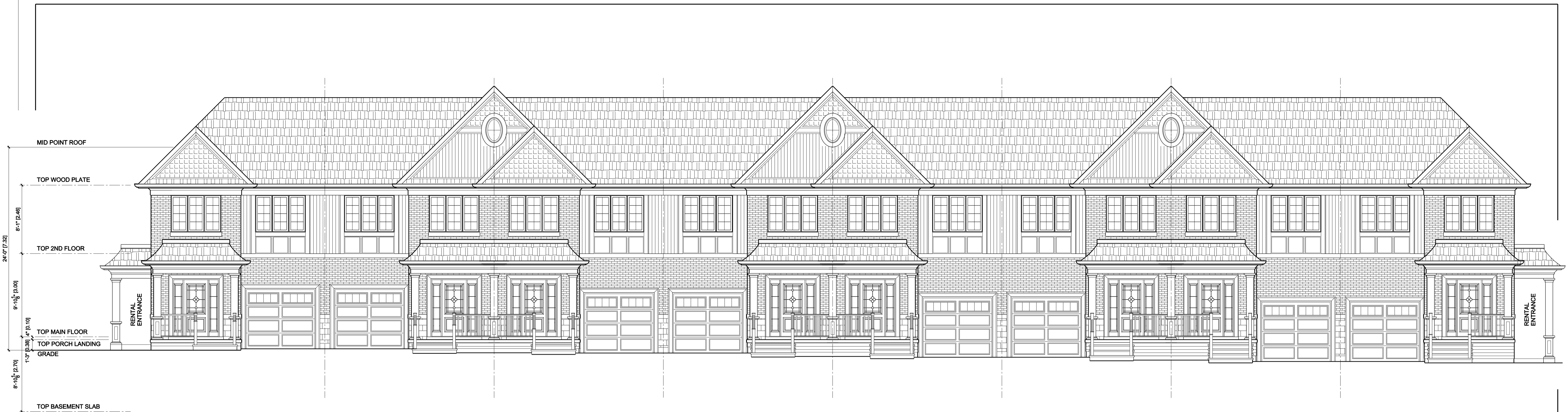
2 STOREY BLOCK FRONT ELEVATION TYPICAL BLOCKS 1, 2, 3 & 4