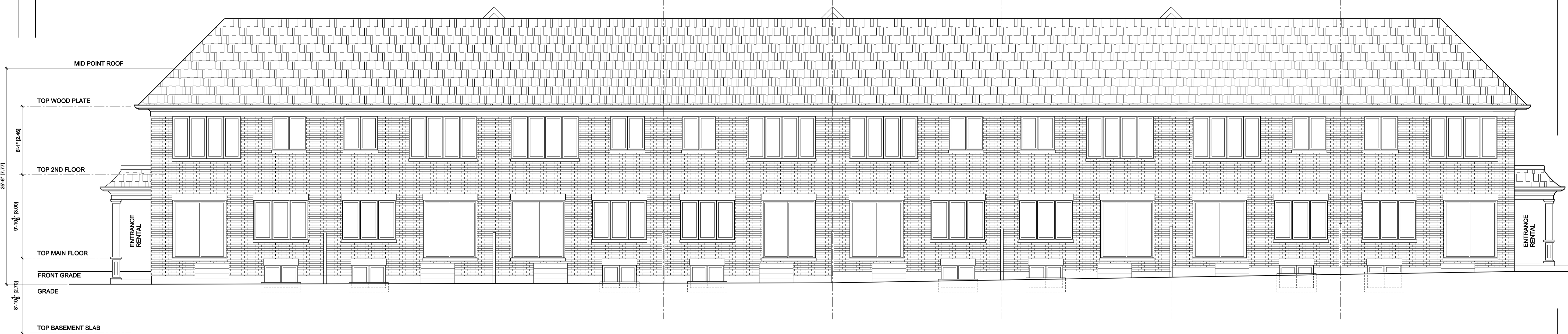
2 STOREY BLOCK REAR ELEVATION TYPICAL BLOCKS 1, 2, 3 & 4