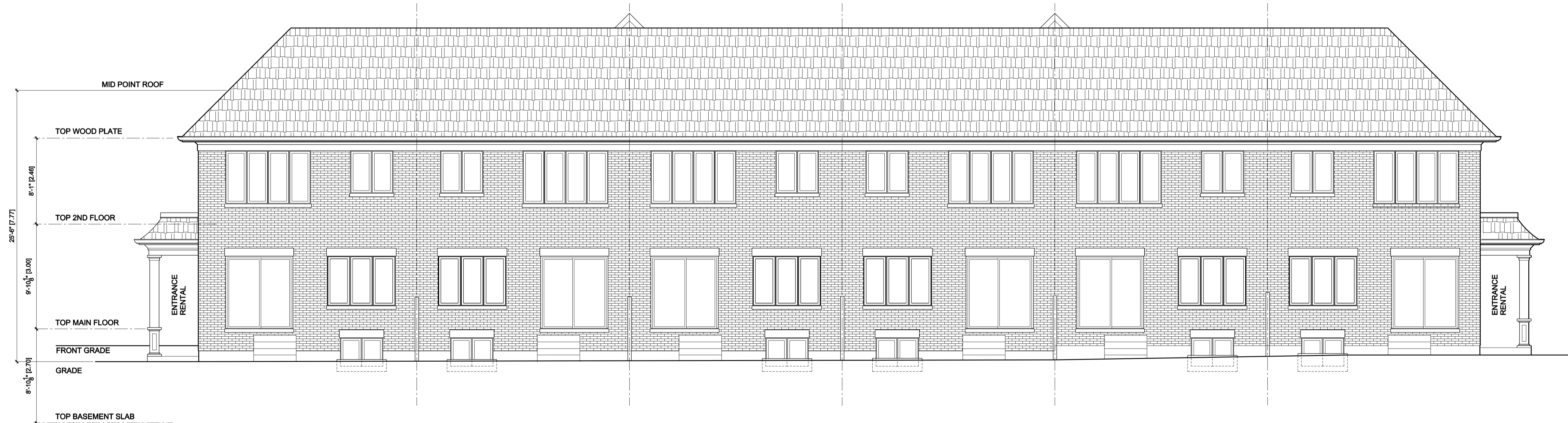
2 STOREY BLOCK REAR ELEVATION TYPICAL BLOCKS 5, 6 & 7