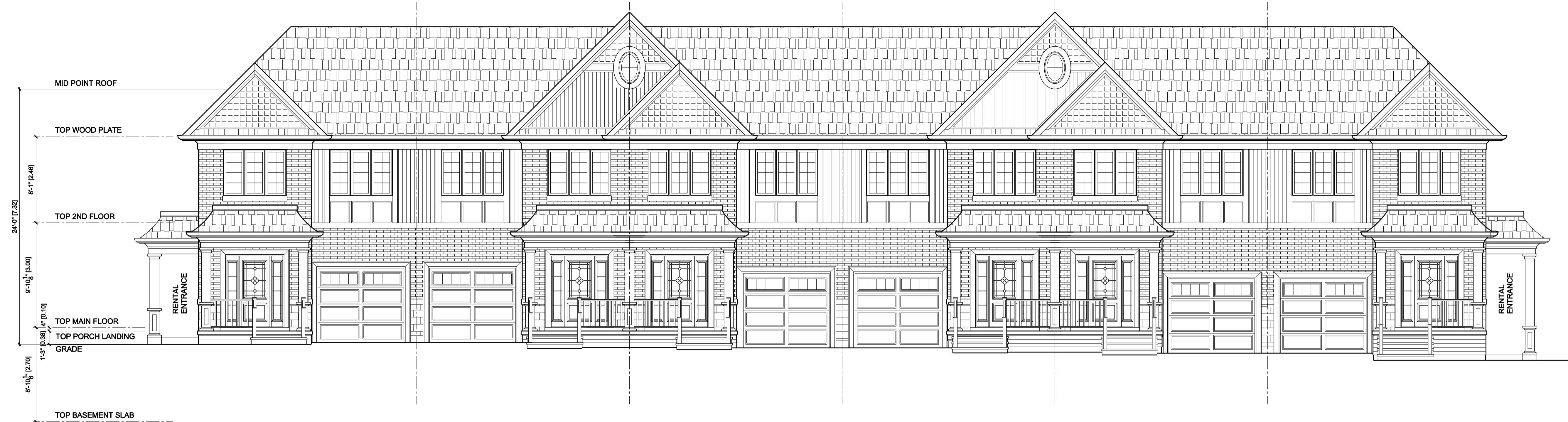
2 STOREY BLOCK FRONT ELEVATION TYPICAL BLOCKS 5, 6 & 7